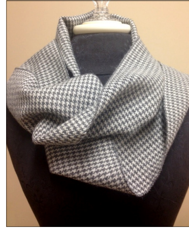
Scarf woven by Phyllis Narus with R&M Yarns 2/16 Baby Alpaca Nat. Grey & Nat. Lightest Grey